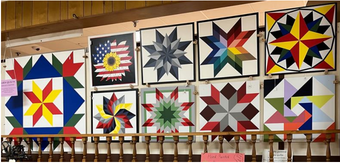
Barn Quilts on display at Yoder's