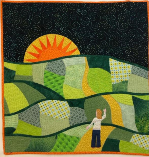
#10 Way Over Yonder