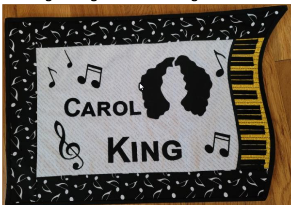
#21 Singer-Songwriter – Amazing!