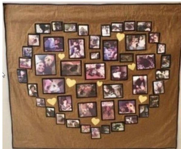
#23 Friends Come in All Shapes and Sizes