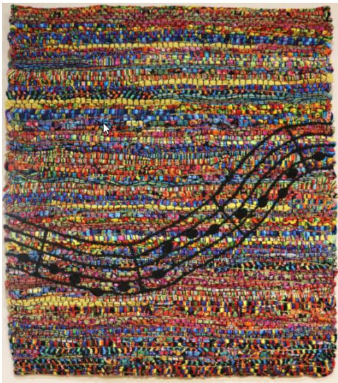
#4 Wondrous Woven Magic