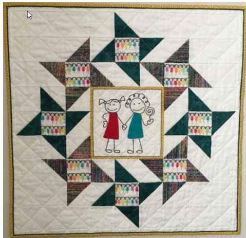
#12 You've Got A Friend